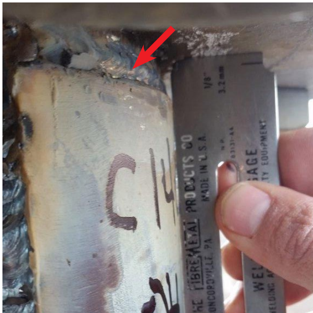
Tower Leg Split Pipe Modification Incomplete Joint Penetration to Leg Flange

Incomplete joint penetration is a joint root condition in which the weld metal does not extend through the joint thickness. In other words, the weld does not penetrate into the root area of the weld. Typically, this condition is identified via UT non-destructive weld examination.