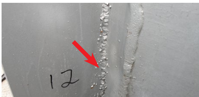
Weld Spatter at a Modification Stiffener and Field-Welded Port Installation

Spatter is the metal particles expelled during welding that do not form part of the weld. Spatter is easily repaired with a grinder.