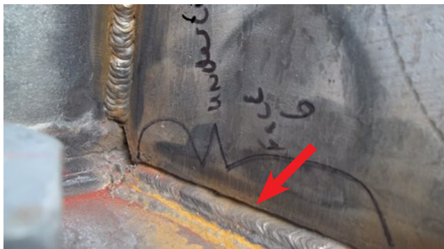
Monopole Base Plate Stiffener Underfill

Porosity is a cavity type discontinuity formed by gas entrapment during solidification. The discontinuity formed is generally spherical and may be elongated. Porosity is caused by contamination during welding. There are various types of porosity including: scattered porosity, elongated porosity, aligned or linear porosity, and piping or wormhole porosity. Similar to undercut, AWS D1.1 allows some porosity in Table 6.1 as acceptable depending on whether the connection is a statically loaded non-tubular connection or a cyclically loaded (fatigue sensitive) non-tubular connection.