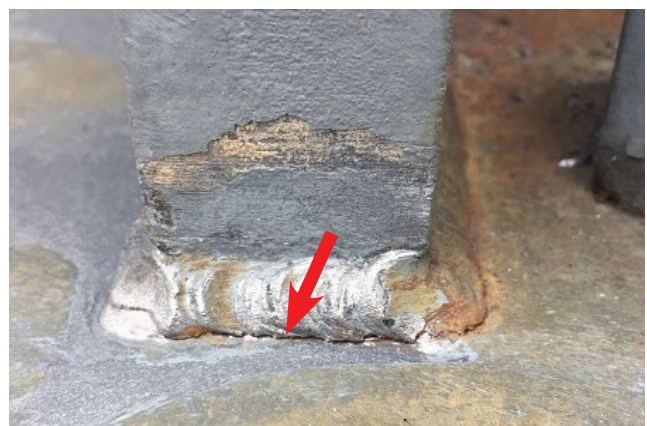
Base Plate Stiffener Weld Lower Toe Crack