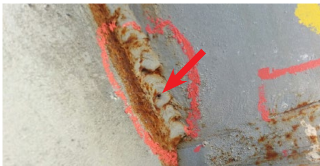
Examples of Porosity in Monopole Modification Welding

Inclusion is defined as entrapped foreign solid material, such as slag, flux, tungsten, or oxide. When it comes to tower and monopole upgrades, typically inclusion is slag left within a complete joint penetration (CJP) weld and is located by a post-modification ultrasonic testing (UT) non-destructive examination. Slag inclusions result from improper welding technique, lack of access, or improper cleaning between weld passes.