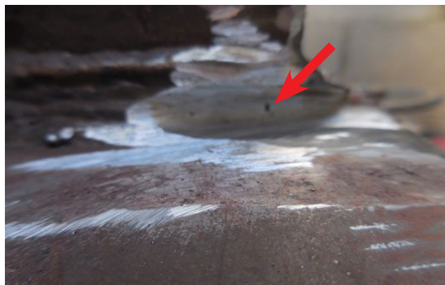
Monopole Base Plate Stiffener Weld CJP Connection Slag Inclusion