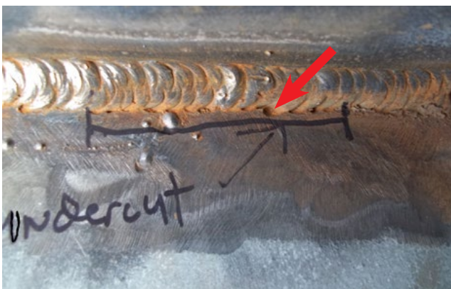
Monopole Modification Weld Undercut