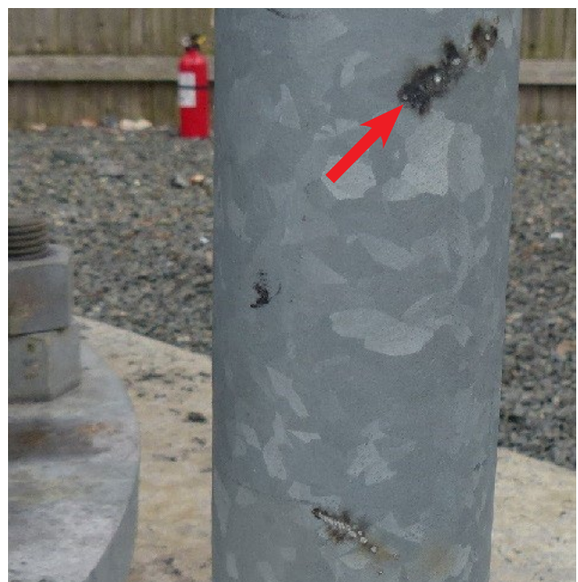
Arc Strikes on Ice Bridge Post

An arc strike is a discontinuity resulting from an arc, consisting of any localized re-melted metal, heat-affected metal, or change in the surface profile of any metal object. Arc strikes result when the welder initiates an arc on the base-metal surface away from the weld joint, either intentionally or accidentally. When arc strikes occur there is a localized area of the base metal surface that is melted and then rapidly cooled due to the massive heat sink created by the surrounding base metal. Arc strikes are not desirable as they can cause cracking.