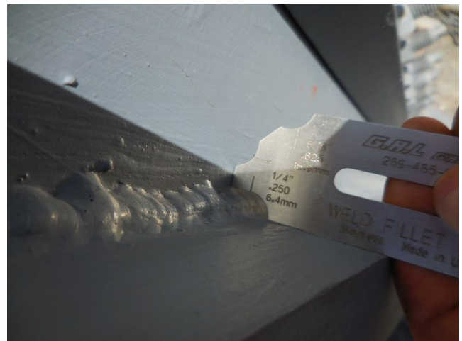
Required Stiffener/Plate Modification 1/4" Fillet Welds Undersized by Fillet Weld Gauge Measurement