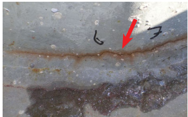
Monopole Base Plate Weld Upper Toe Crack

There are numerous types of cracks: longitudinal, transverse, crater, throat, toe, root, under bead, heat-affected zone. Per AWS D1.1 Structural Welding Code, no crack is allowed to remain in service after identification – "any crack shall be unacceptable, regardless of size or location." Cracks are very detrimental to the performance of a structure, can accelerate the negative effects of fatigue, and can cause the failure of the structure under load. A crack at the base of a monopole can cause catastrophic failure of the structure.