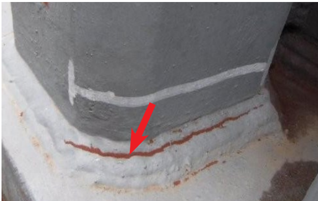
Anchor Rod Bracket Longitudinal Crack (Shown in Red)