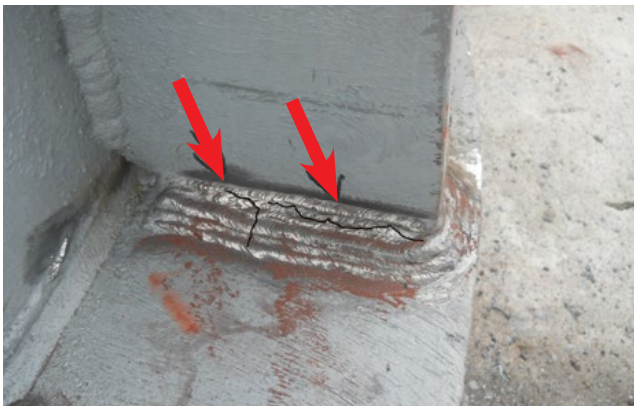
Stiffener Longitudinal & Transverse Cracks (in Black)