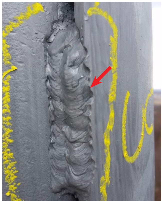
Tower Leg Split Pipe Stitch Weld Undercut

Undercut is defined as "a groove melted into the base metal adjacent to the weld toe or weld root and left unfilled by weld metal." Undercut can greatly reduce the fatigue-resistance of a welded connection. Undercut is generally associated with either improper welding techniques or excessive welding currents, or both. AWS D1.1 Table 6.1 allows some undercut as acceptable depending on whether the connection is a statically loaded non-tubular connection or a cyclically loaded (fatigue sensitive) non-tubular connection.