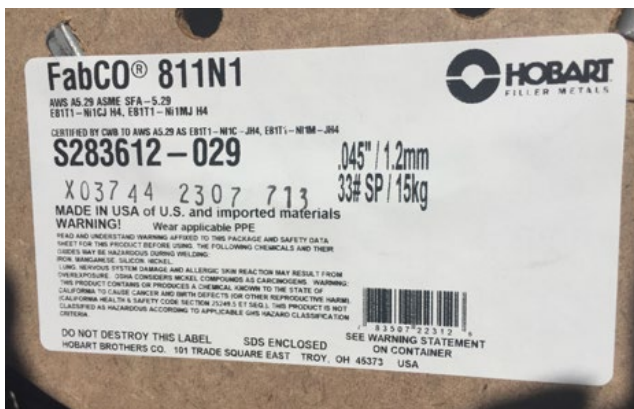
FCAW E81T1 Wire

The material identification identifies the type and grade (strength) of the material. The CWI will ask for the material certifications which are provided by the