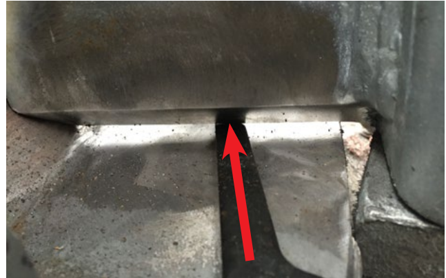
Root Gap to Base Plate Below Anchor Rod Bracket