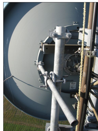
Figure 1: Six-inch (6") Antenna with Proper Installation. (NOTE: Best Practice is to cut the strut off twelve inches (12") past the attachment point and galvanize with Zinga or Zinc Coat.)

stiff arms, etc.), the support structure (typically a tower or pole), and the elliptical waveguide, coax, or hybrid cable. When reviewing a site, we need to look at all elements individually.