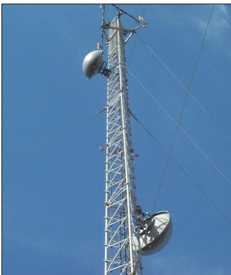
Figure 3: Remember: Look Up Before You Climb!

It is important to understand that a strut is a structural component carrying a specific load from the microwave antenna into the supporting structure and must be connected to a structural member capable of supporting the loads. Because the strut is supporting a portion of the wind from the front face of the microwave dish, installing the strut incorrectly will create problems with the alignment (e.g., loss of signal and increase maintenance requirements) and can reduce the life of the mount and structure (e.g., metal fatigue, stress fractures, and bending of structural components). To put this in perspective, on a typical 6' diameter microwave antenna, the strut is part of a 3-point connection transferring as much as 1,400 pounds of force into the supporting structure. When that strut is not positioned properly in both the installation planes (e.g., 25° in the horizontal and 5° in the vertical plane, manufacture dependent) and at its attachment placement (i.e., tower, antenna, or mount attachment), the mounting solution can create a situation where the mounting system can be damaged and fail to maintain alignment. In addition, forces from a misplaced strut onto a member of the supporting structure can result in damage to that member.