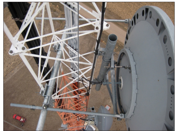
Figure 2: Eight-inch (8") Antenna with Proper Installation of the In-Board / Out-Board Struts with a Common Strut Support.

Mounts are typically selected to be supported from a single leg, but for proper microwave alignment, and to protect the underlying structure, it may be necessary to utilize a face mount connected to two adjacent legs. This is where the structural engineer must review the