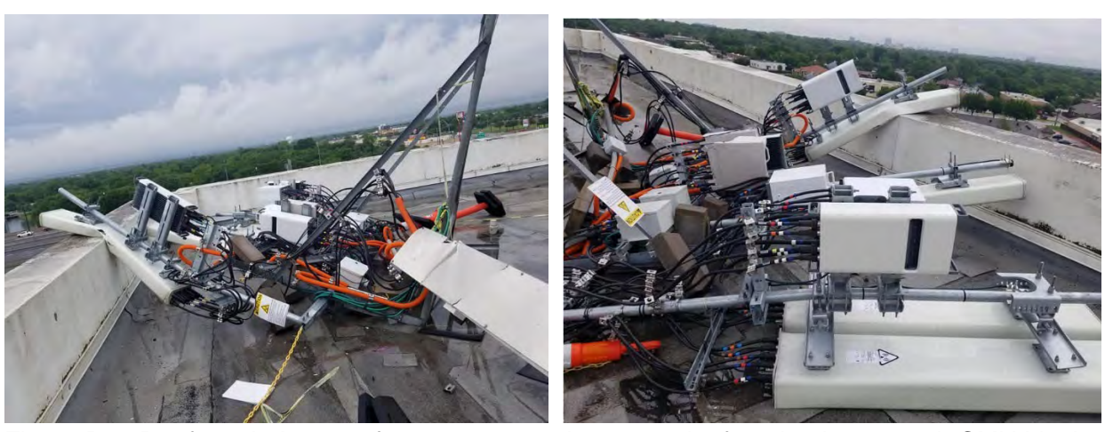
Figure B.1: Rooftop sled-mount frame overturned as a result of not having enough CMU blocks