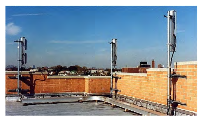
Figure A.a.4: Pipe wall mount installed on parapet wall of a building