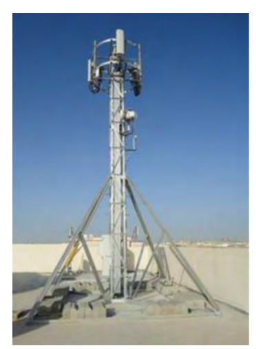
Figure A.d.1: Small Latice Tower ballasted on corner of a building roof