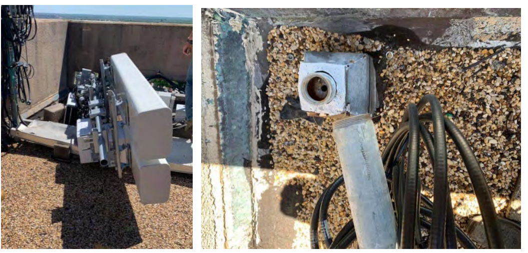
Figure B.4: Parapet Panel antenna mount failure due to improper anchorage