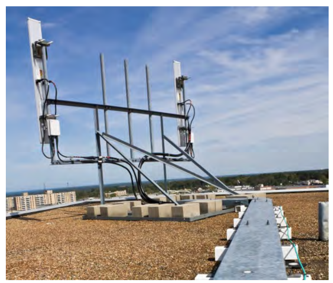
Figure A.b.5: Non-Penetrating ballasted sled mount