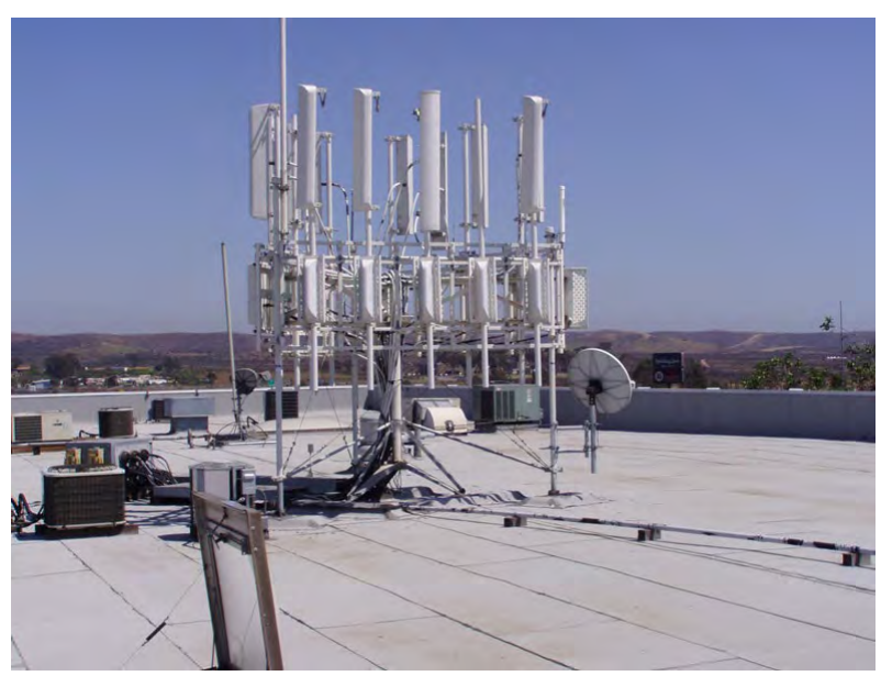
Figure A.b.3: Custom penetrating triangular frame with tripod mount