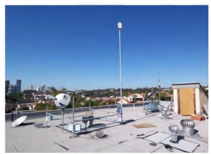
Figure A.b.1: Custom penetrating mount supporting radio and dish equipment