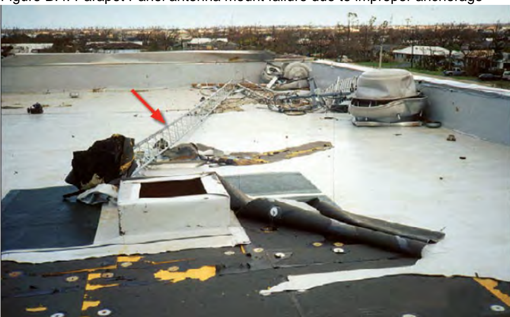
Figure B.5: Collapse of roof mounted antenna tower including progressive peeling of the roof membrane (Refence: FEMA 543 Risk Management Series: Design Guide for Improving Critical Facility Safety from Flooding and High Winds (January 2007))