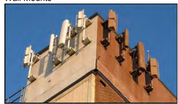
Figure A.a.1: Wall mount installed on outside of building