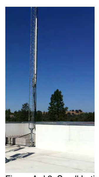
Figure A.d.2: Small Latice Tower ballasted on corner of a building roof