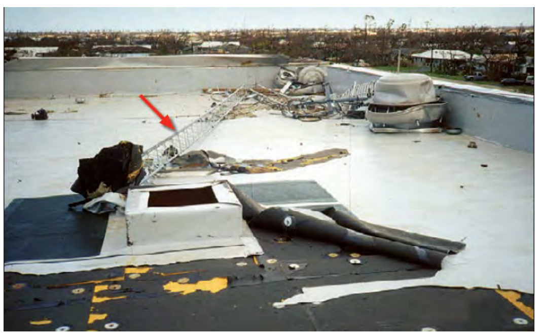
Figure B.5: Collapse of roof mounted antenna tower including progressive peeling of the roof membrane (Ref: <u>FEMA 543</u>)