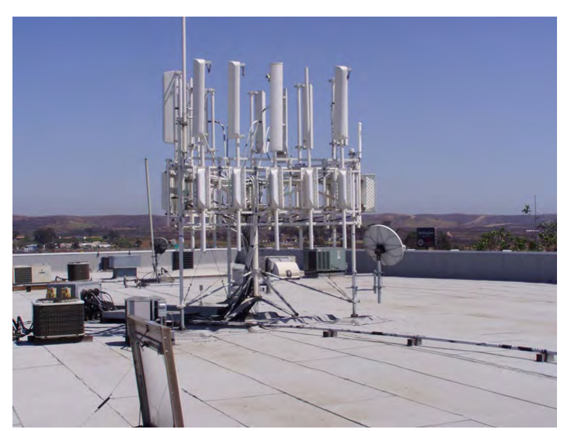
Figure A.b.3: Custom penetrating triangular frame with tripod mount