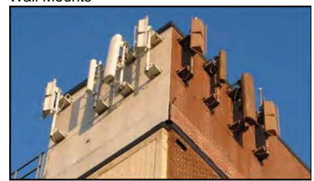
Figure A.a.1: Wall mount installed on outside of building