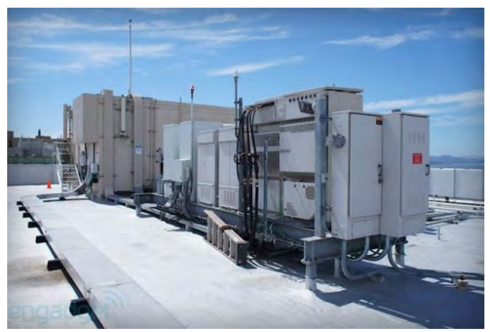
Figure A.c.1: Custom equipment platform