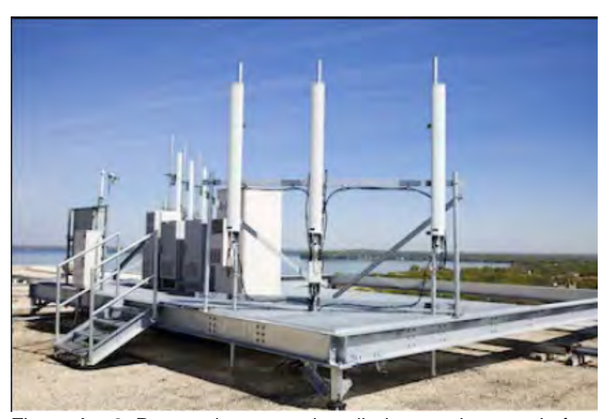
Figure A.c.2: Penetrating mount installed on equipment platform