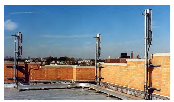
Figure A.a.4: Pipe wall mount installed on parapet wall of a building