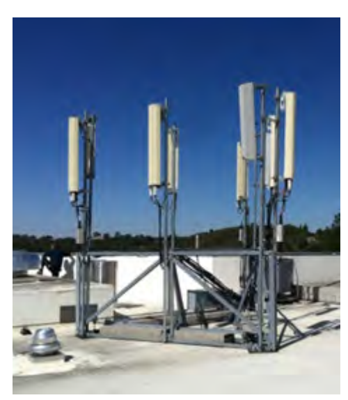
Figure A.b.7: Non-Penetrating ballasted triangular mount