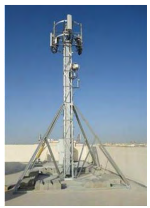
Figure A.d.1: Small Latice Tower ballasted on corner of a building roof