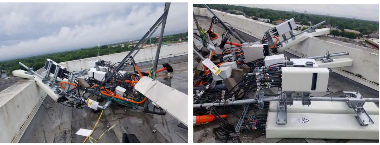
Figure B.1: Rooftop sled-mount frame overturned as a result of not having enough CMU blocks