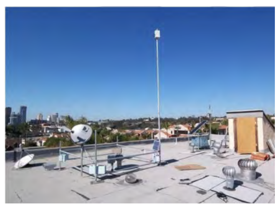
Figure A.b.1: Custom penetrating mount supporting radio and dish equipment