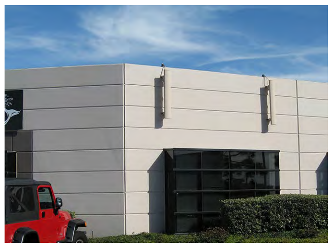
Figure A.a.5: Pipe wall mount installed on the wall of a building