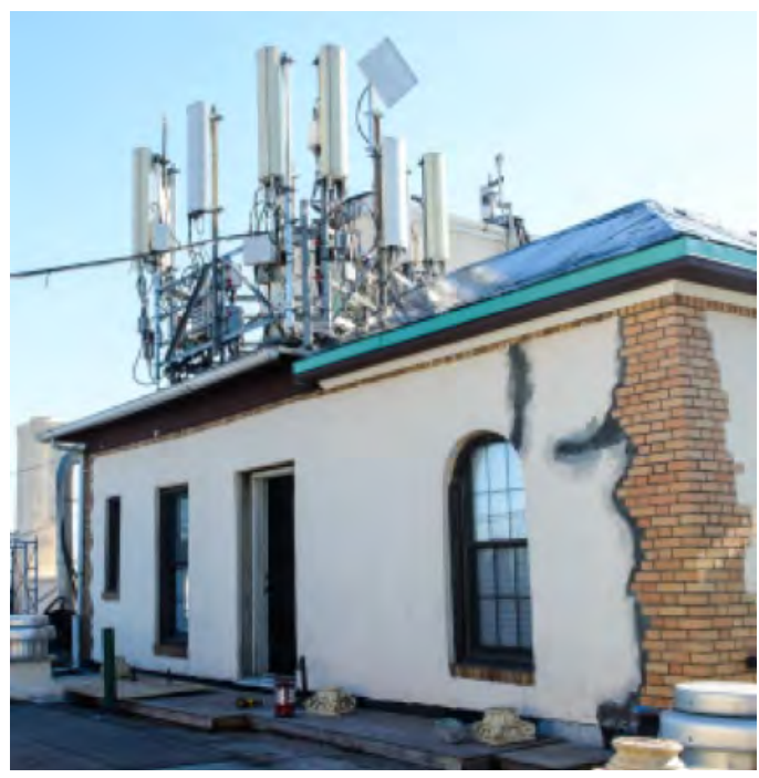
Figure A.b.4: Custom penetrating rooftop mount installed on penthouse roof