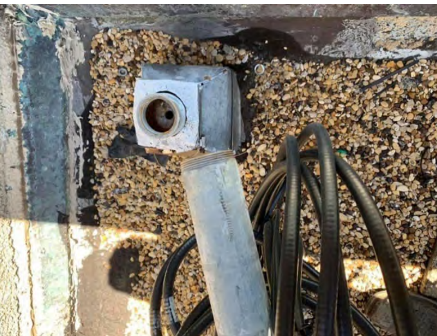
Figure B.4: Parapet Panel antenna mount failure due to improper anchorage