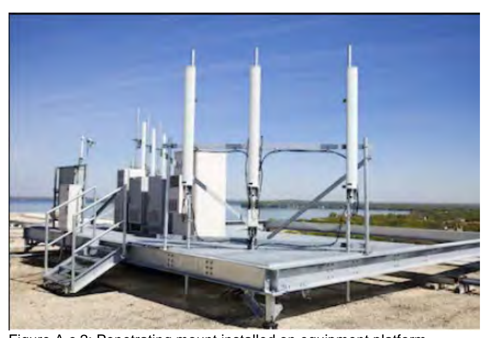
Figure A.c.2: Penetrating mount installed on equipment platform