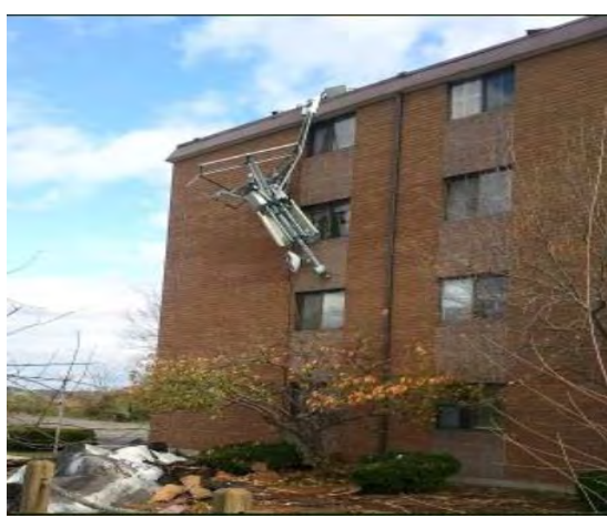
Figure B.3: Rooftop tripod mount fell off the roof as a result of not having enough CMU blocks or proper ancorage

(Refence: FEMA 543 Risk Management Series: Design Guide for Improving Critical Facility Safety from Flooding and High Winds (January 2007))