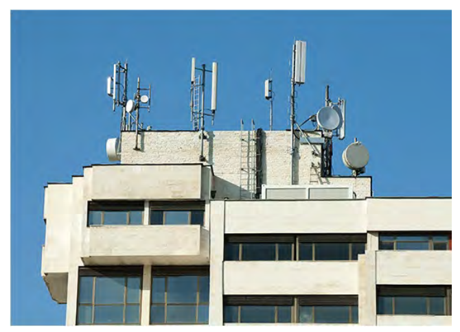
Figure A.a.3: Different types of wall mounts installed on the penthouse wall of a building