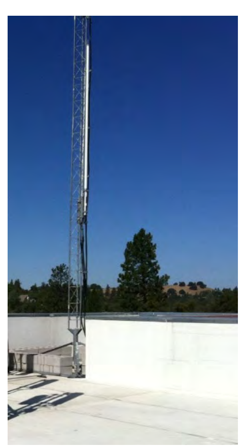
Figure A.d.2: Small Latice Tower ballasted on corner of a building roof