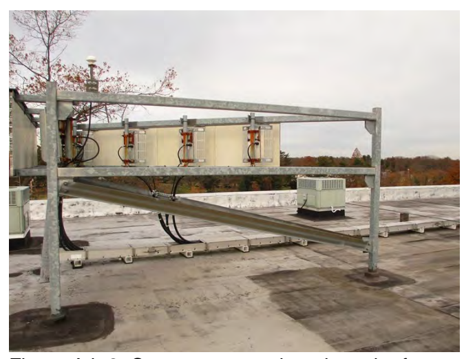
Figure A.b.2: Custom penetrating triangular frame