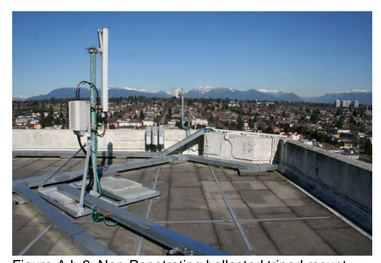
Figure A.b.6: Non-Penetrating ballasted tripod mount