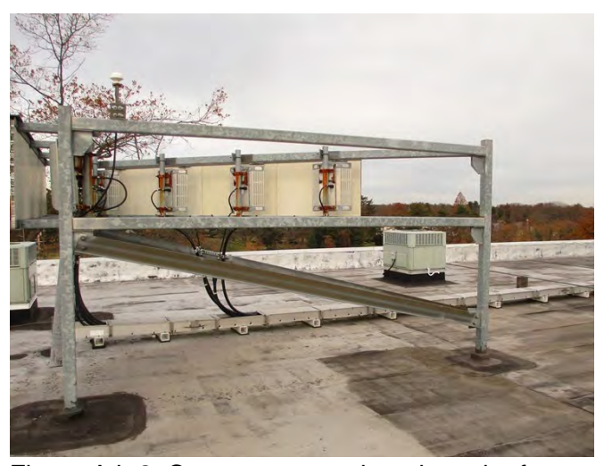
Figure A.b.2: Custom penetrating triangular frame